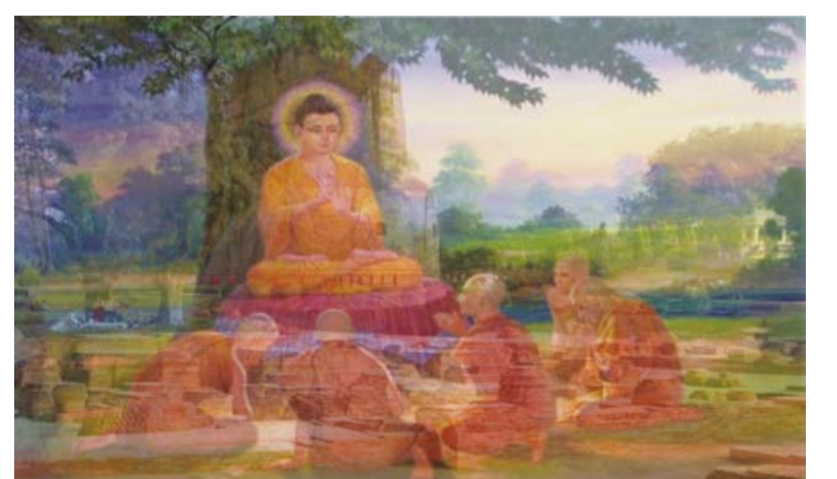
석가모니불이 성도하신 후 녹야원(鹿野苑)에서 최초로 21일간 화엄경을 설법하신

대반열반경 제15권 범행품(梵行品) 第2 復次善男子 言本有者 我初得阿耨多羅三藐三菩提時 有諸鈍根聲聞弟子以有鈍根聲聞弟子故 不得演說一乘之實 言本無者 本無利根人中 象王迦葉菩薩等 以無利根迦葉等故 隨宜方便開示三乘 我初得阿耨多羅三藐三菩提時 有諸鈍根聲聞弟子以有鈍根聲聞弟子故 不得演說一乘之實 言本無者 本無利根人中 象王迦葉菩薩等 以無利根迦葉等故 隨宜方便開示三乘